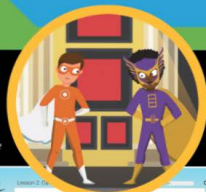
Digital Super Hero's Browser and Mainframe