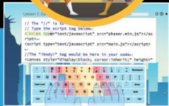
Learn to Type Code