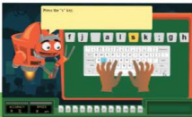
K2 Learn to Type Module