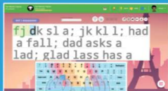
3-12 Student Keyboard